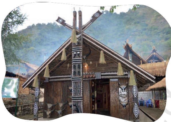
Figure 5.3: Open air museum at the Kisama Heritage Village with houses of different tribes in Nagaland, each with its unique design.

Do you have traditional things in your house things which can be displayed in museum? Look around and bring them into the classroom. If you cannot bring these artefacts into the classroom, take their photographs or drawings and these could be a part of your museum.