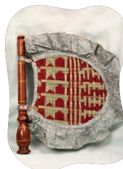
Figure 5.15: An old handmade fan (Pankha) made of recycled wool and cloth that was used before electricity reached all homes

There is a story behind each artefact and you need to present it to each visitor to the museum. You can do this in many ways, you can find a folk story about the artefact or develop a story. You can make videos (especially for objects you