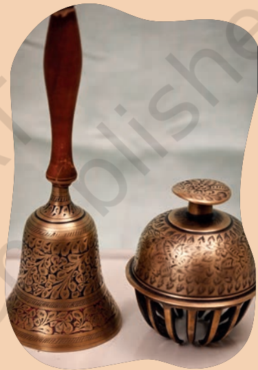
Figure 5.6: Old brass bells

Choose one of the artefacts selected for exhibition in the museum. Create a timeline showing its history and evolution, including when it was commonly used and, if still in use, how it is being used. You can also record any significant event related to it, for example, some relative brought it as a gift on the occasion of your grandparent's marriage, and it was the first of its kind in the village (for example, an old radio or camera).