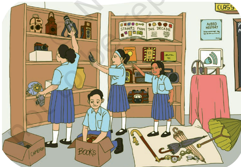
Figure 5.1: Setting up a school museum