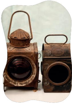
Figure 5.8: Old railway lanterns