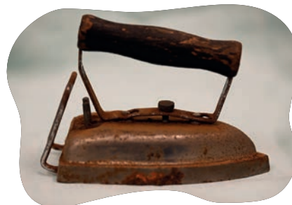
Figure 5.7: Old travelling iron from the 1950s that worked on electricity

Within the group, select five artefacts that you think should be part of the exhibition in the museum. You will have to decide on the final set of exhibits with all your peers. Remember, you must choose carefully, and also explain why you chose these artefacts and not the others.