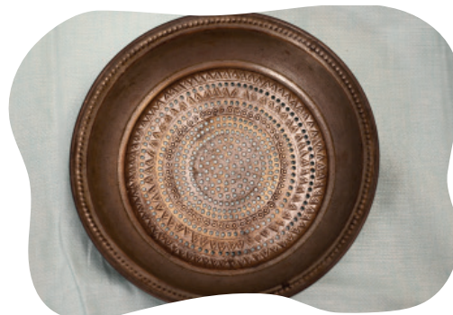
Figure 5.11: Brass sieve from the 1940s