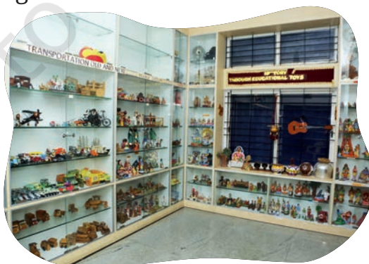
Figure 5.16: A museum display in a school showing history of educational toys

Practise giving an oral description of the artefact in your group before showcasing it to visitors.