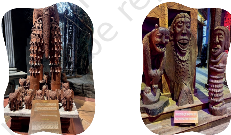
Figure 5.2: The Tribal Museum of Madhya Pradesh in Bhopal has displays of the traditional art, craft and culture of various tribes

Museums also help us to learn about the present culture and work of different groups of people in the country and the world. They display artefacts related to art, traditions (Figure 5.2), architecture, and science. For example, the National Science Centres/Museums spread across India help us to learn about things that no longer exist, such as dinosaurs, and also about things that we can expect in the future. There are even some curious objects that defy what we think or we know, like a 1200 kg granite ball that spins on water at the National Science Centre in Delhi.