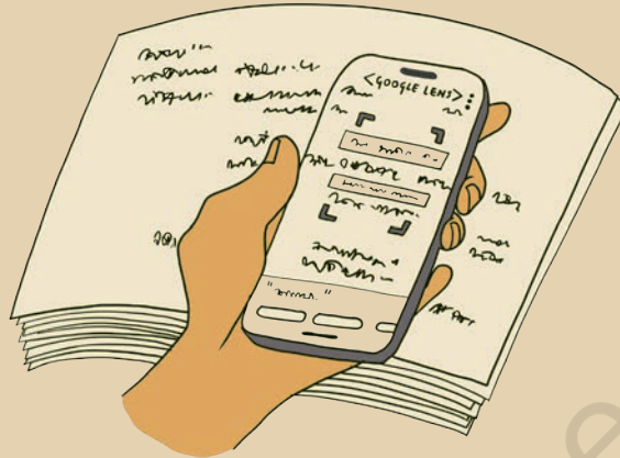
Figure 5.12: AI tools use for translation

AI tools such as Google Lens, Microsoft Office Lens, Adobe Scan and Text Fairy can read text from images by using Optical Character Recognition (OCR). You can use them to read old documents that are difficult to read or to translate documents in a language that you understand.