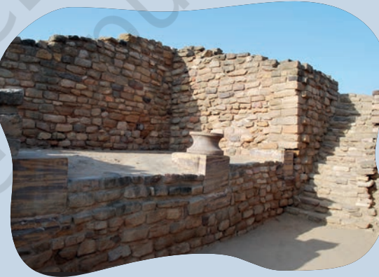
Figure 5.4: Sentinel room in eastern gate of castle, Dholavira

Archaeological sites are places where evidence of ancient human societies is preserved. These sites are excavated by archaeologists. They carefully dig up these sites, and analyse the artefacts and other remains that are uncovered. These artefacts help us to understand the kind of societies that existed many years ago at these sites. The objects discovered during excavation are kept in a museum located near the site.