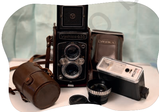
Figure 5.10: Camera, flash and lenses from the early 1960s