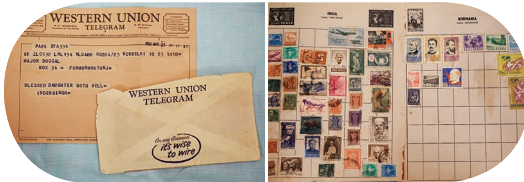
Figure 5.13: Telegram and stamps from the 1960s

For example, a brass article needs to be washed and polished, a wooden object needs to be dusted with a soft brush, and clothes should be hung carefully, away from any nail or sharp edge. Photographs should be carefully kept in envelopes, ensuring they do not get bent or out of shape.