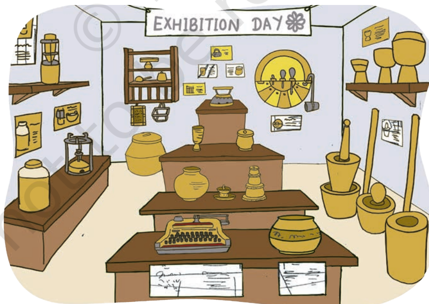
Figure 5.17: Display of collected artefacts