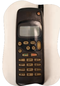
Figure 5.9: Mobile phone from the year 1998

All the artefacts are important, and even if your artefact is not included in the final exhibition, you learnt something valuable about local history and culture.